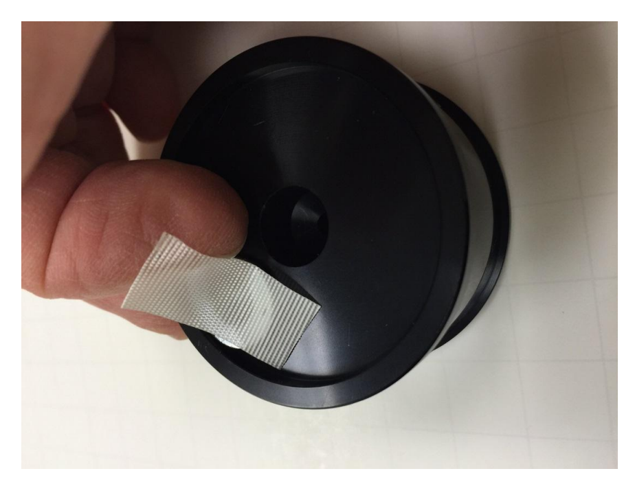
Below is an image showing the counterweight properly installed

Using a 1" (2.54cm) length of cloth tape, secure the counterweight in place by taping it to the back of the knob Use caution not to apply the tape to the top ring on the back of the tuning knob, keeping all of the tape on the inside recessed surface (tape may be trimmed to fit if necessary). Press firmly on complete top surface of tape to ensure the counterweight is secured in place. An extra length of tape provided in case first application difficulties